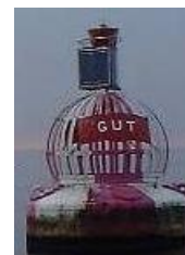
Gut Gas Buoy (Wpt. A)

NOTE - NO RESPONSIBILITY CAN BE ACCEPTED BY PRESTON MARINE SERVICES LTD. AS A RESULT OF USING THESE NOTES AND DIAGRAM. May 2010. REFER TO ADMIRALTY CHART 1981